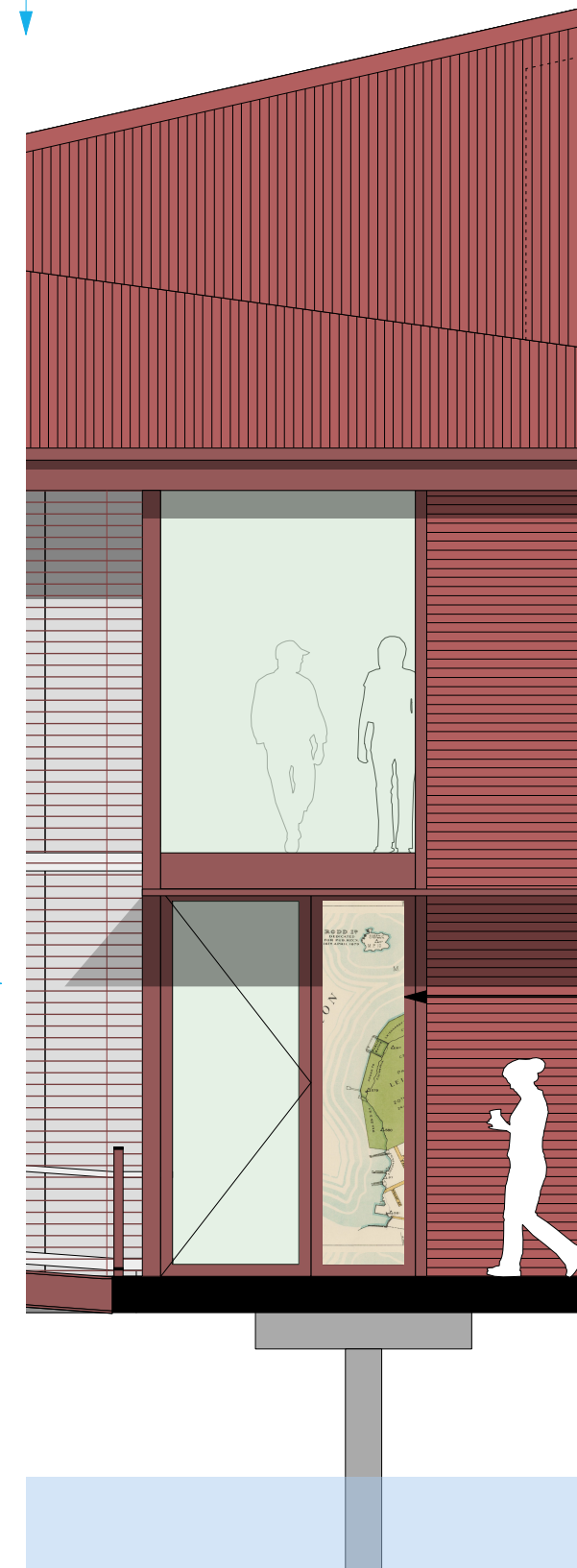
Detail - not to scale